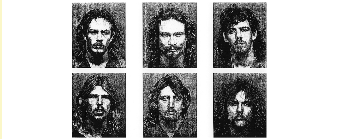
Figure 1. Lineup used in Ref. [38], which demonstrates the oddball bias.

lineup. To implement the appropriate double-blind procedures, Loftus sent the lineup to Thomas Busey without telling him who the suspect was. Busey showed the lineup to a sample of people in Indiana, telling them only that one of the lineup members was suspected of a crime and asking them to guess the suspect. The suspect was chosen 26% of the time, which is considerably above the chance rate of 17%*.